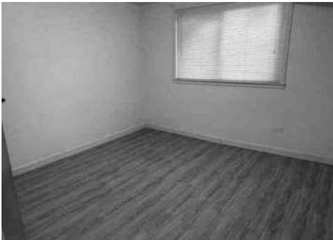
Basement Bedroom 1