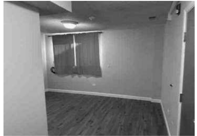
Basement Bedroom 2