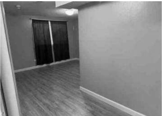
Basement Bedroom 3