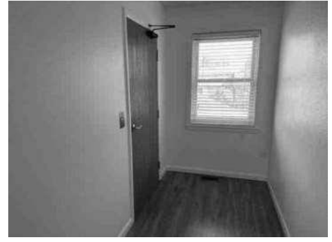
Elevator – Second Floor