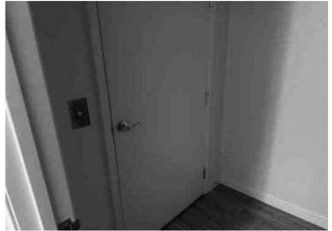
Elevator – Basement Floor