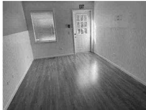
Second Floor Loft