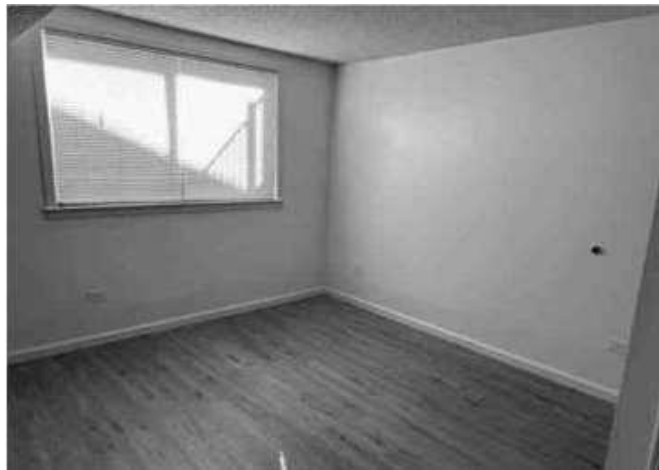
Basement Bedroom 1