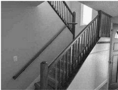
Stairs to Second Floor