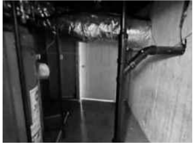
Basement - Mechanical