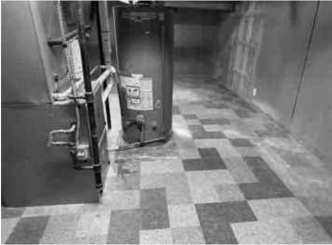
Basement - Mechanical