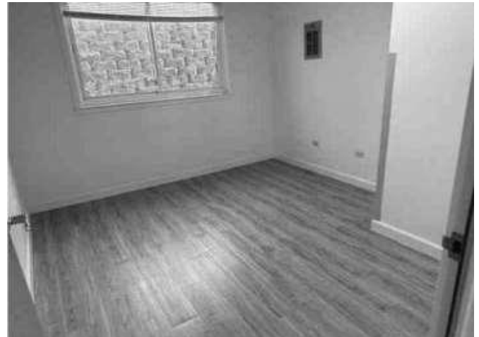
Basement Bedroom 2