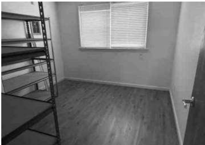
Basement Rec Room