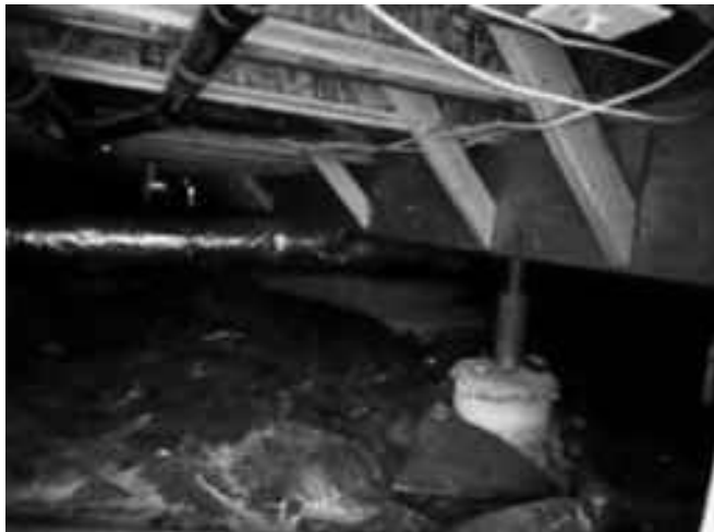
Attic Crawl Space