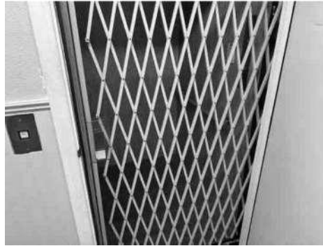
Elevator – Interior Door