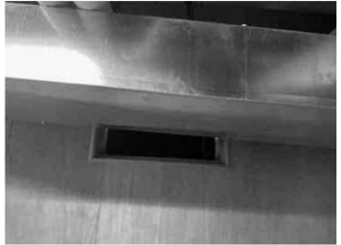
Crawl Space Access