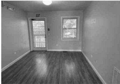
Loft – Second Floor