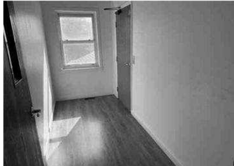
Elevator – Second Floor