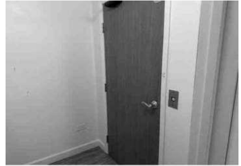
Elevator – Basement Floor